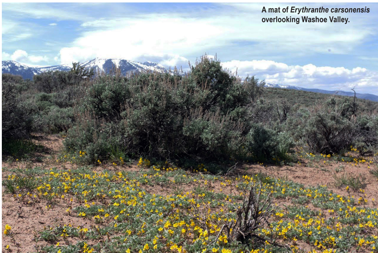
A mat of Erythranthe carsonensis overlooking Washoe Valley.

Jack's Valley. Except for 2011, which was unusually cold and wet, the winter and spring weather was exceptionally dry. You may remember the unusual mid-winter wildfires in Reno and Pleasant Valley, driven by high winds and parched vegetation. For a plant with roots that rarely extend beyond three inches deep, winter and spring rainfall are critical to growth and reproduction. During these severe drought years, our searches yielded very few plants. At the type locality on the southwestern slope of Prison Hill, a team of eight interns and two botanists managed to find only a single flowering plant.